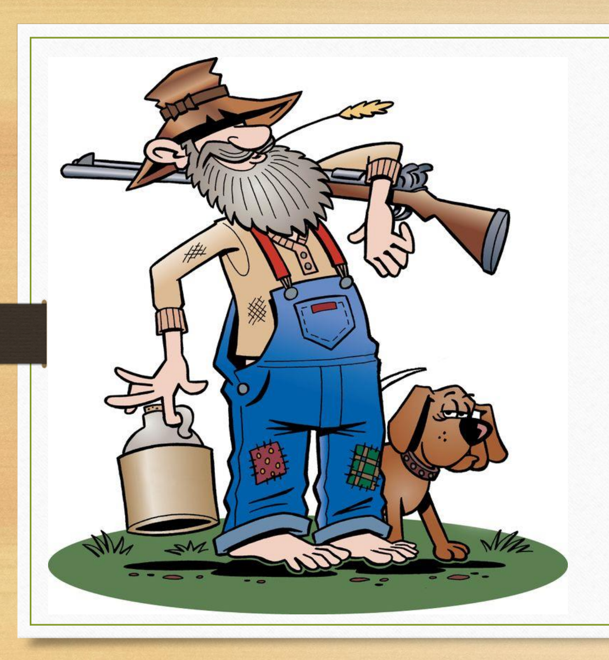
Illustration – Redneck Perception